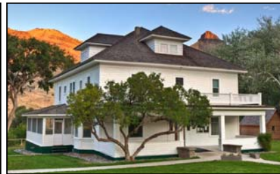
James Cant Ranch