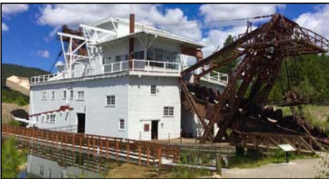
Sumpter Gold Dredge

Details of the tour are being finalized now. Be sure to send in or email your application soon to reserve your spot. We hope to see you in John Day for the Journey through Time Tour!