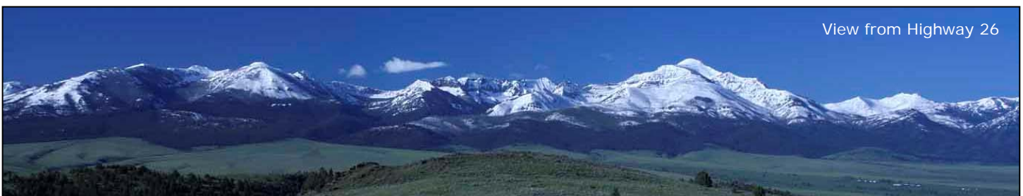
View from Highway 26