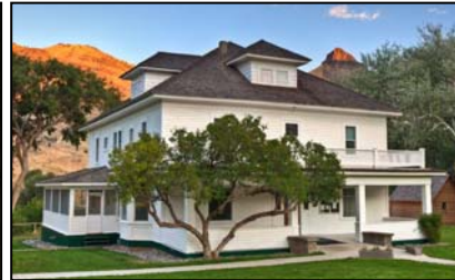
James Cant Ranch